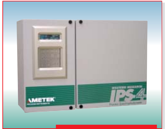
Western Research Model IPS-4

The IPS-4's optical system is designed to increase reliability and dramatically reduce the need for routine maintenance, thereby drastically cutting its cost of ownership. The lamp