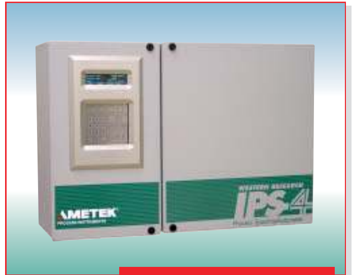
Western Research Model IPS-4

The IPS-4's optical system is designed to increase reliability and dramatically reduce the need for routine maintenance, thereby drastically cutting its cost of ownership. The lamp